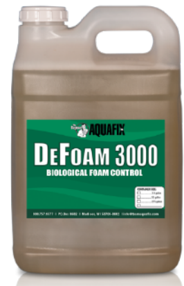
DeFoam 3000 provides excellent foam control in Anaerobic Digestors.