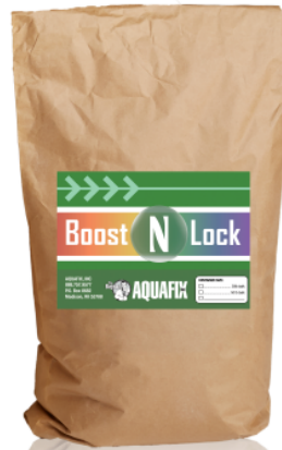
For digesters with low starting pH use Boost N Lock first to raise pH above 6.